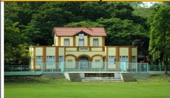
Play Ground & Gymkhana Building