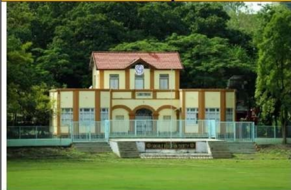
Play Ground & Gymkhana Building